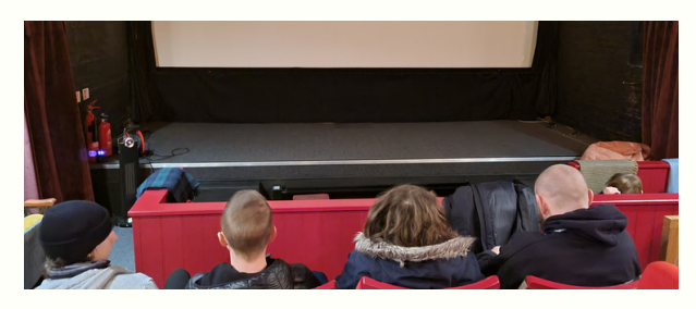
Above: Students waiting for the film to start at The Northern Lights Cinema in Wirksworth.

Meanwhile, students from the Special School went on a visit to The Northern Lights Cinema, in Wirksworth, to see Clifford. They had a fantastic time and were very grateful to Into Films who gave them the opportunity. They also made some microwave popcorn as a little treat. It was a fantastic little cinema and they will definitely be going again.